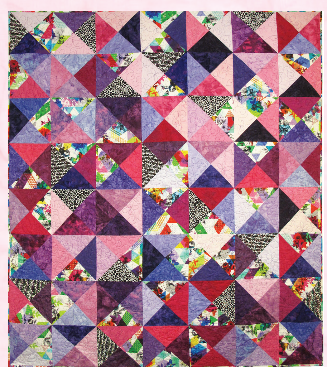
Finished Size 60" x 68"