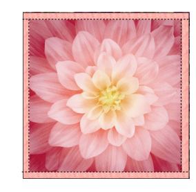
1. Add Inner Borders (1A and 1B strips) to Center Panel