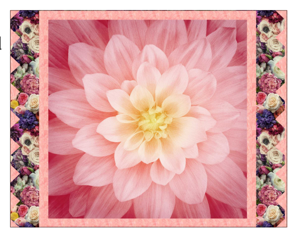
Add Middle Pieced Border