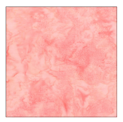
Blush 1895 391