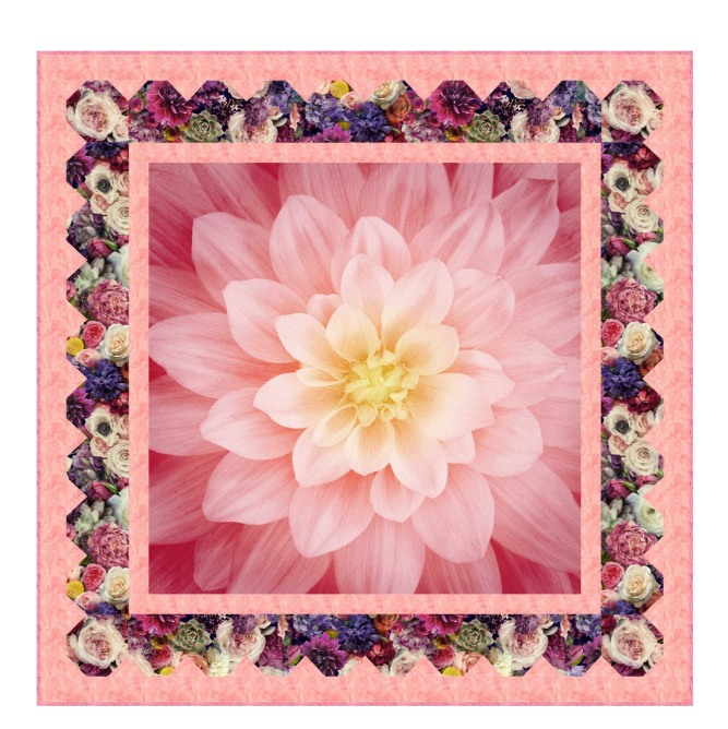
Add Outer Border using 3A strips and 3B strips