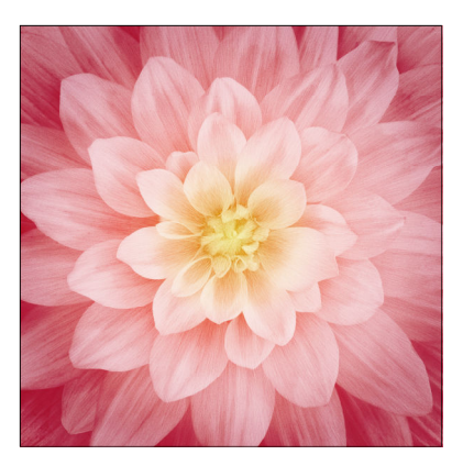
Wild Rose 4389 94