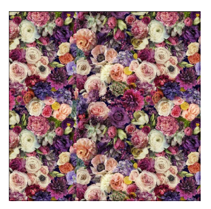
Peony 4371 333