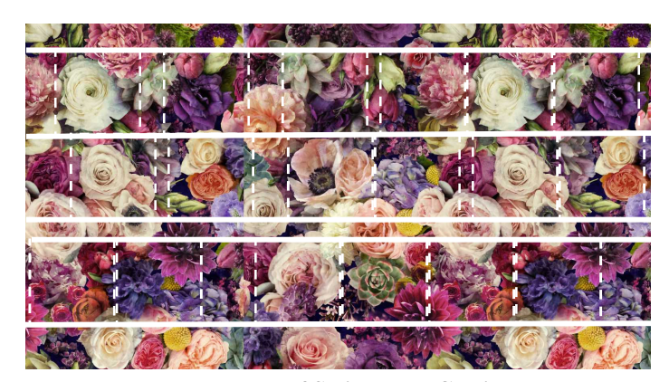
Example of Strip Fussy Cutting

For the Center Border pieces: This print is densely printed with digital flowers. Look at YOUR piece of the Peony fabric. Use the Strip Fussy Cutting method to cut. That is, cut strips to contain lots of flowers. You should have at least 45" of fabric but only NEED 37 1/2" so you have a bit of leeway. Plan your cuts. Most often, you will be able to cut and get 3-5 whole flowers. Not every square should have a flower centered, but it is nice to have many centered and other squares have recognizable bits to create a "Bouquet" effect. Cut 6 strips that are 6 1/4". Then cut 6 squares (6 1/4") from each strip. Note that when you cut your squares, you can again plan your cuts. The squares don't have to be cut in succession. You can trim a bit to better position the next flower as illustrated below: